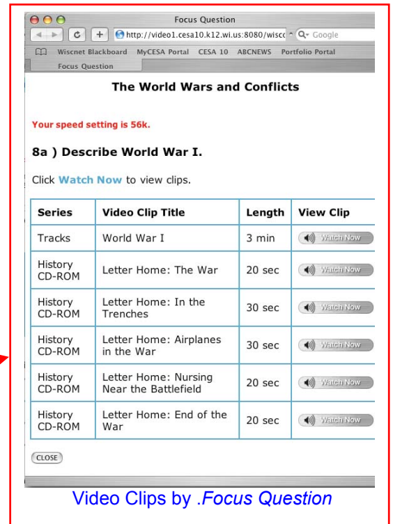
Video Clips by .Focus Question